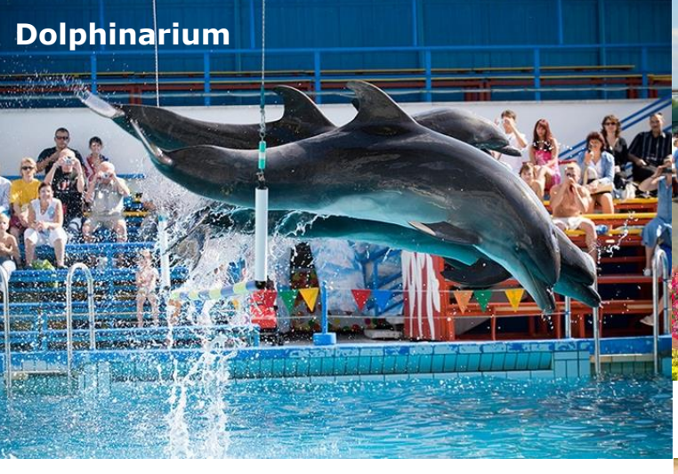
ROSTOV - CITY OF LOVE!